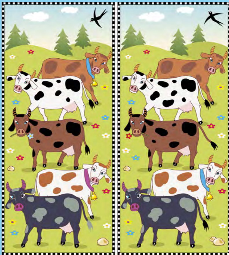
1. Bird 2. Tree 3. Brown Cow's collar 4. White Cow's spot 5. Middle Cow's flower 6. Middle Cow's tail 7. Ground flower 8. White Cow's collar 9. Gray Cow's tail 10. Rock